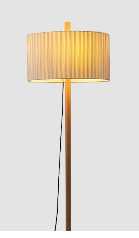
Ø450mm 17 11/16"